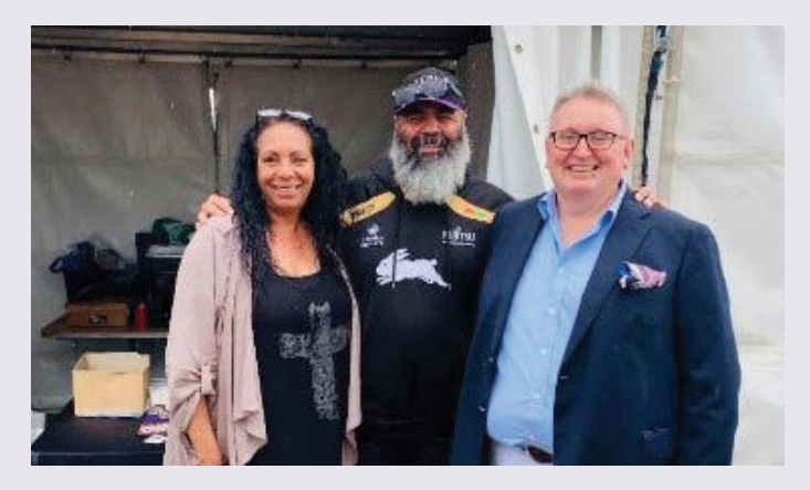
WITH THE HON DON HARWIN MLC MINISTER FOR ABORIGINAL AFFAIRS