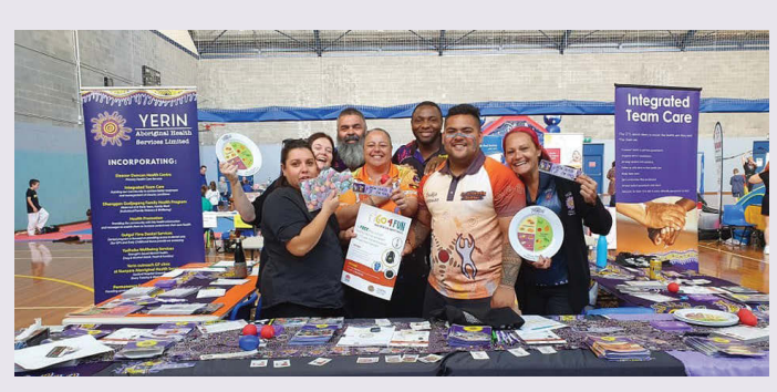
OCEANIA TOBACCO CONTROL CONFERENCE