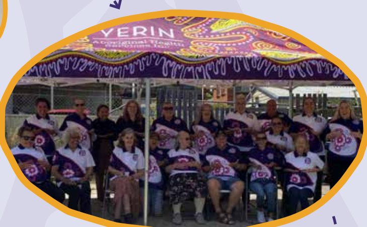
Ngnamus Bus Morning -Screen them all, big or small